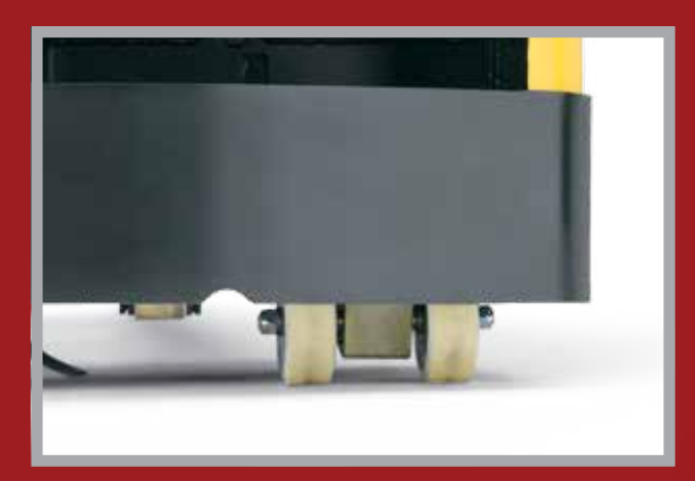
Quick-adjust dual caster wheels