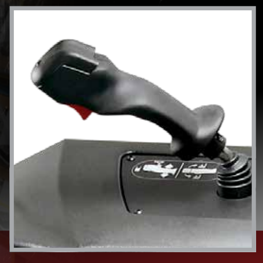
The contoured multifunction control handle offers three adjustable positions and allows fingertip control of lift/lower, travel and horn functions