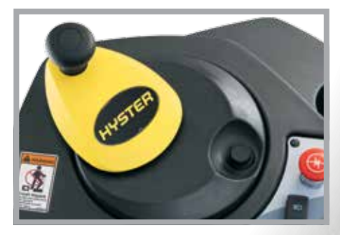
Adjustable steering tiller makes comfort and handling a priority