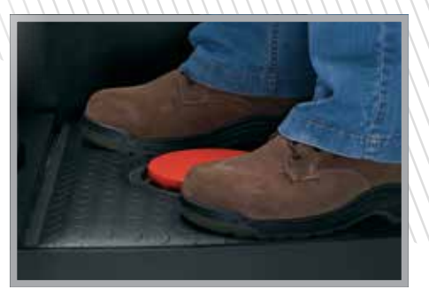
Multi-zoned operator presence floor system