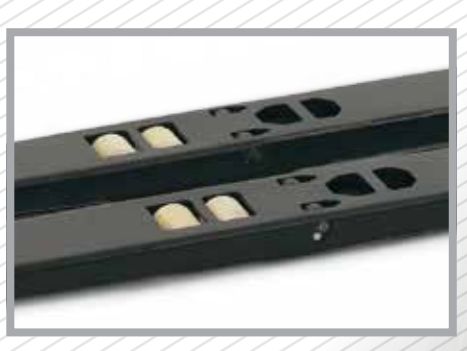
Tandem load wheels (extended tips only)